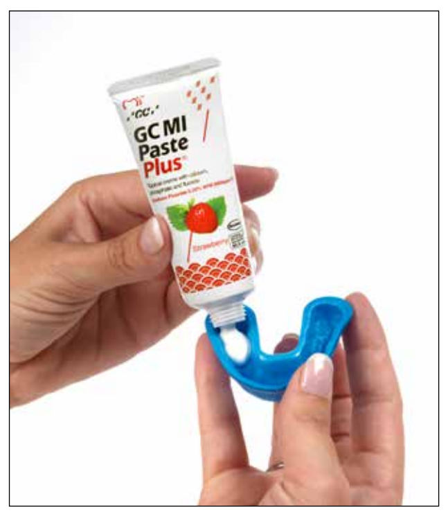
Note: you can apply Tooth Mousse and MI Paste Plus topically to the teeth with a custom-made tray.